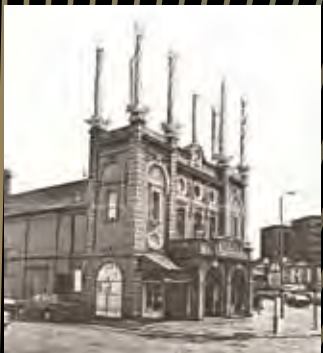
A 1983 drawing by sculptor John Buckley (designer of the famous legs) depicting the Duke's as a cake with eight candles on the roof