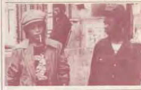
Film listings, the Argus, early 1980's

Thursday - Saturday April 8-10 CLARENCE AND ANGEL (U) at 5.45 & 9.30 MON ONCLE (U) at 3.40 & 7.30