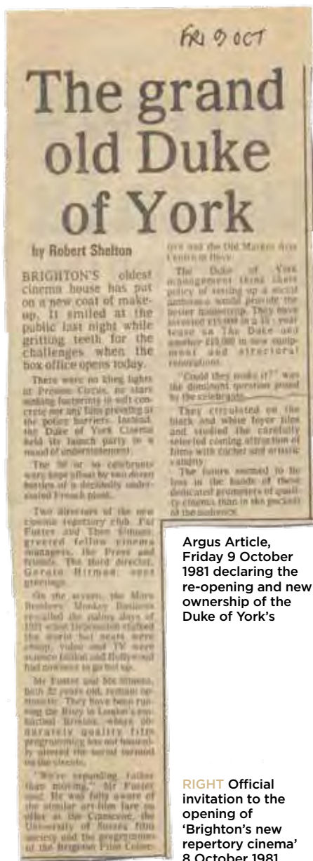
Argus Article, Friday 9 October 1981 declaring the re-opening and new ownership of the Duke of York's